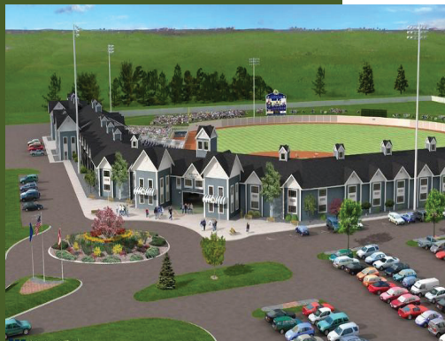
Stadium Exterior View