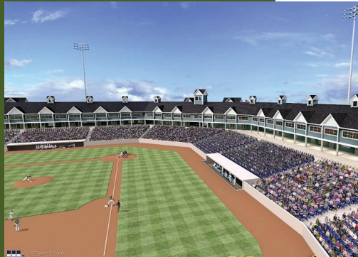
Third Base Line

Through ongoing communication with the client, the Argianas team took a challenging appraisal and addressed the valuation issues associated with appraising special use facilities. A report that was done right and on time facilitated financing, allowing Wuerfel Stadium to open on time for the first pitch of the season.